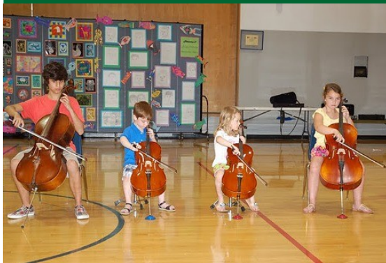
CSS Southfield Cello Students perform at the 2011 Spring Fine Arts Festival.